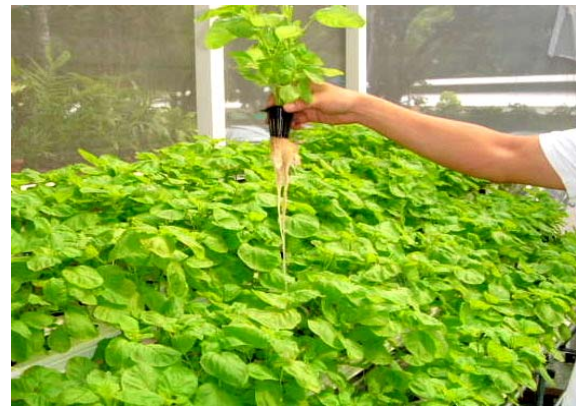
Commercial Hydroponic System (comes c/w seeds, nutrient solution, germination sponge, instruction manual, etc...) Retail Price S$ 2,500.00 + Optional Greenhouse S$ 3,500.00